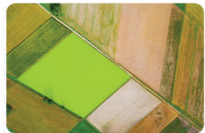
Interoperability between platforms

Data can be shared across the industry and is traceable through the supply chain