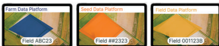
Different ID for each data source