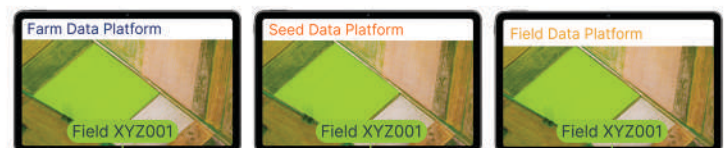
Same ID for each data source